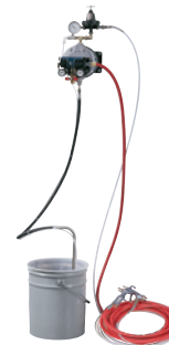
Wall-mount units do not include suction hose, siphon tube or pail. Must order separately.

*Bare packages do not include hose and gun.